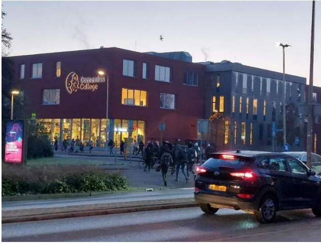
Our school is at the third entrance, Lijstersingel 18: