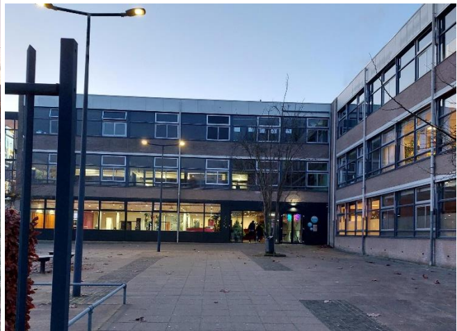
We will be happy to see you and have a great week!